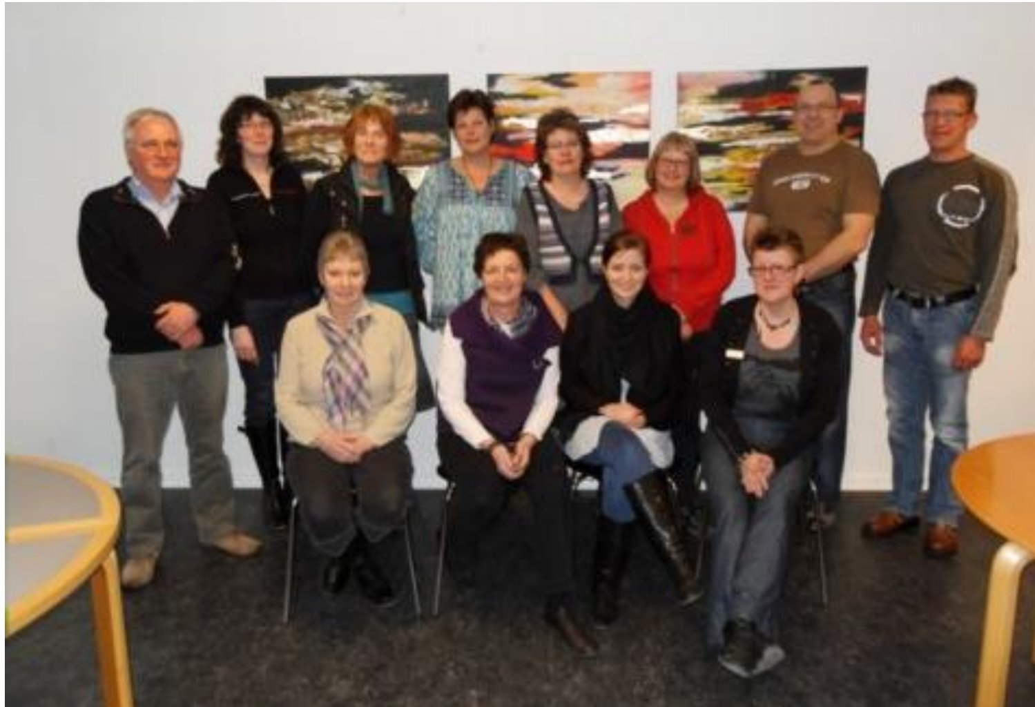
A group of new educated volunteer social Mentors